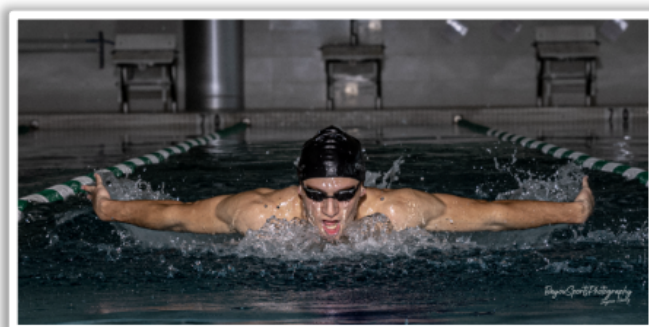
Individual custom sports sessions and senior sessions