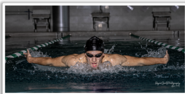
Individual custom sports sessions and senior sessions